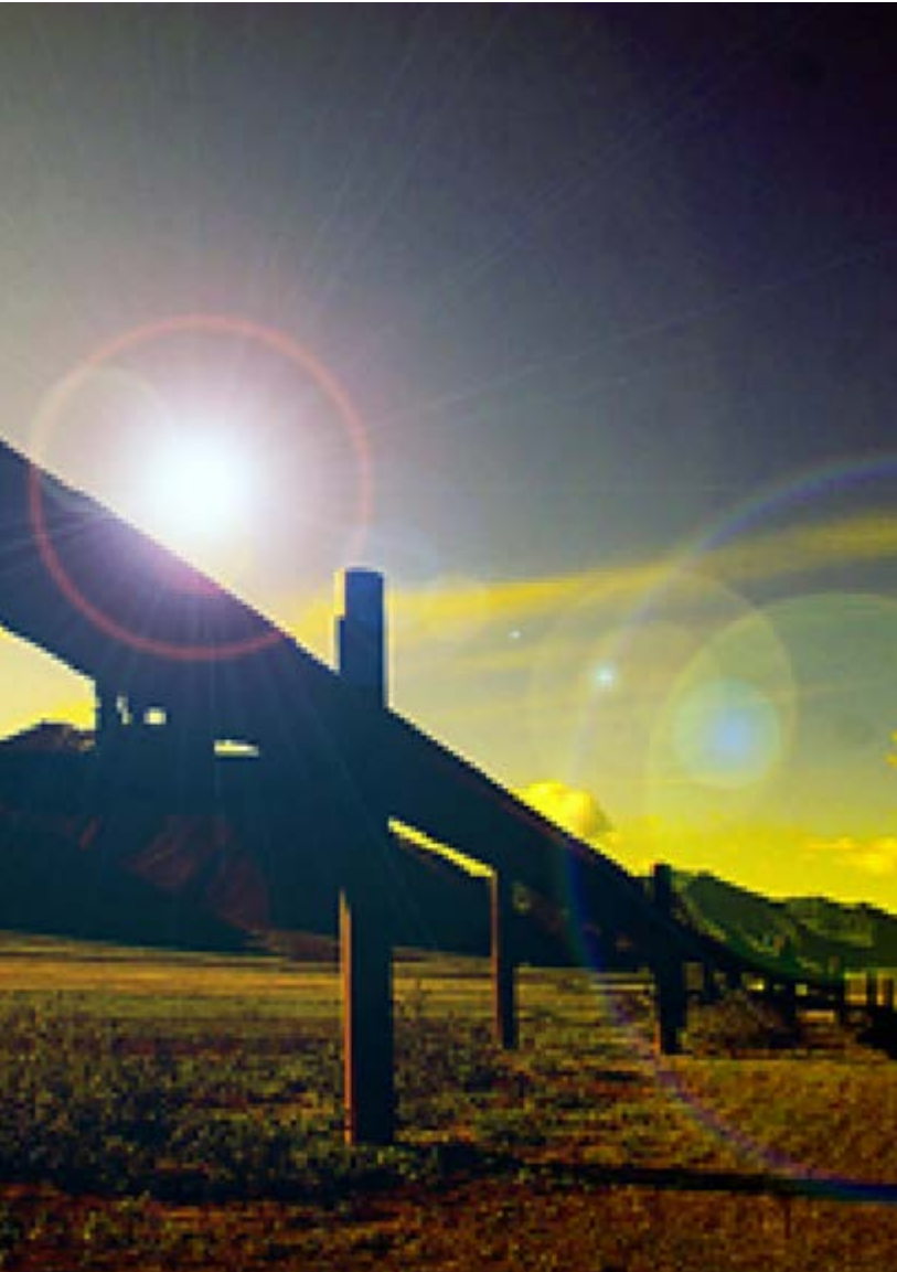
Combined Turnover Growth

WorleyParsons encourages long-term growth by offering round-the-clock assistance with procurement, sales and marketing, budgeting, tender applications, accounting, administration, as well as financial and legal advice.